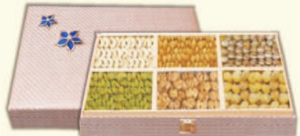
Wooden Series 6 Part - 1200g. ₹. 2050/-