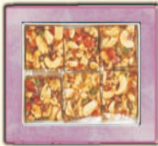
Dry Fruit Chikki 250g. ₹. 225/- Dry Fruit Chikki 500g. ₹. 450/-