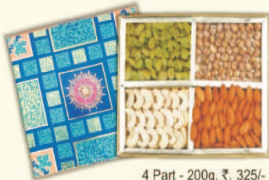
4 Part - 200g. ₹. 325/-