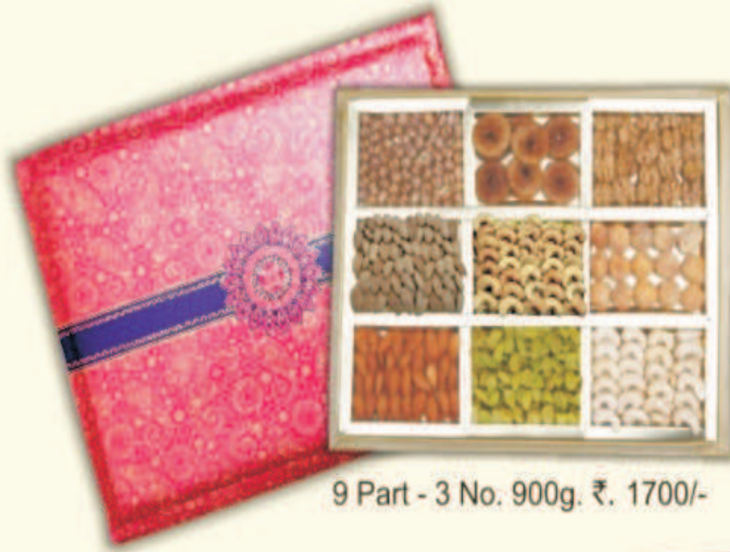
9 Part - 3 No. 900g. ₹. 1700/-