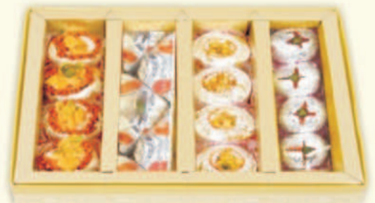
Mithai Box 800g. ₹. 1120/-