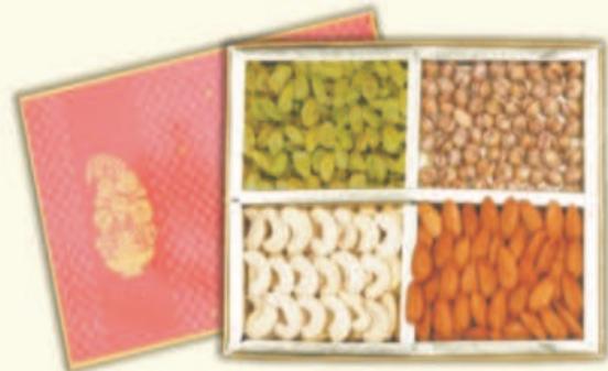
4 Part - 400 g. ₹. 610/- 4 Part - 600 g. ₹. 860/-