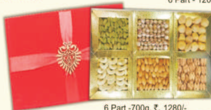
6 Part -700g. ₹. 1280/-