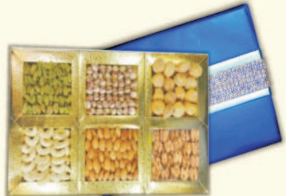
6 Part - 500g. ₹. 900/-