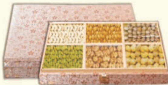
Wooden Series 6 Part - 600g. ₹. 1150/-