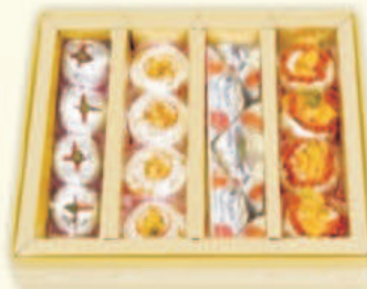
Mithai Box 400g. ₹. 560/-