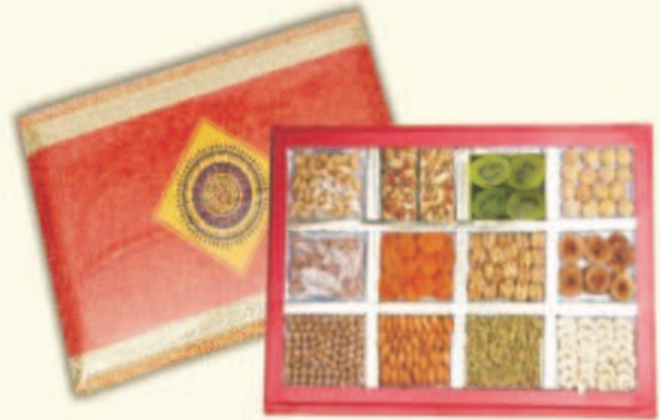
12 Part - 5 No. - 1200g. ₹. 2500/-