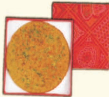
Kaju Rotla 250g. ₹. 280/-