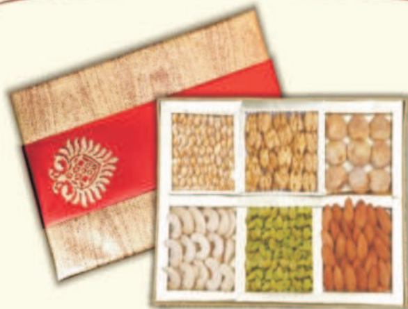
6 Part - 300g. ₹. 540/-